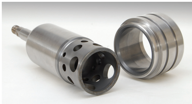
A practical application for an improved fastening technique such as GenFixx is pictured above.